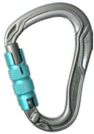
HMS Bulletproof Triple 73727

Issued by EDELRID, GmbH & Co. Isny, Germany 07/17/2018. The precautionary call for a safety check concerns both carabiner models with manufacturing codes 2018 01 and 2018 02: