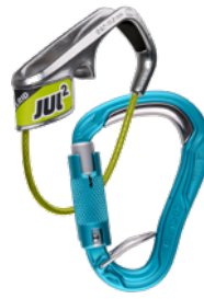
Jul² Belay Kit Bulletproof Triple 73732