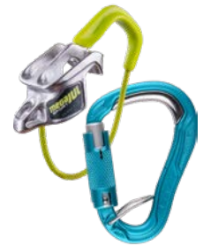
Mega Jul Sport Belay Kit Bulletproof Triple 73735