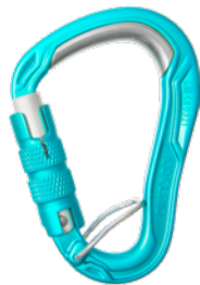
HMS Bulletproof Triple FG 73728